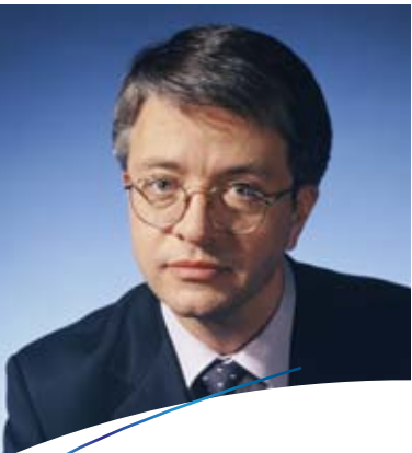
Jean-Laurent Bonnafé Chief Executive Officer BNP Paribas Fortis

Jean-Laurent Bonnafé has been Chief Operating Officer of BNP Paribas' group in charge of the retail banking activities of the Group since September 2008.